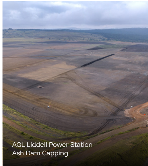
AGL Liddell Power Station Ash Dam Capping