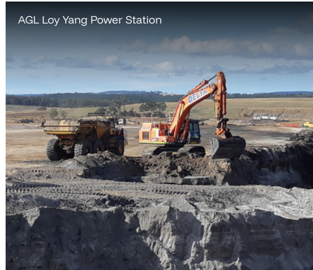
AGL Loy Yang Power Station