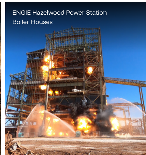
ENGIE Hazelwood Power Station Boiler Houses