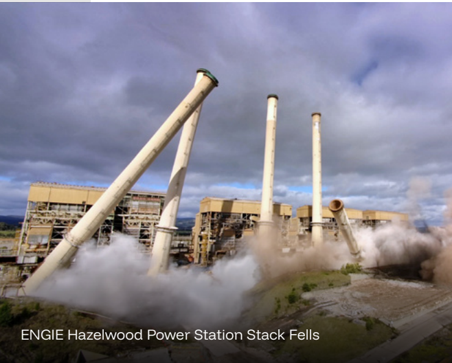
ENGIE Hazelwood Power Station Stack Falls