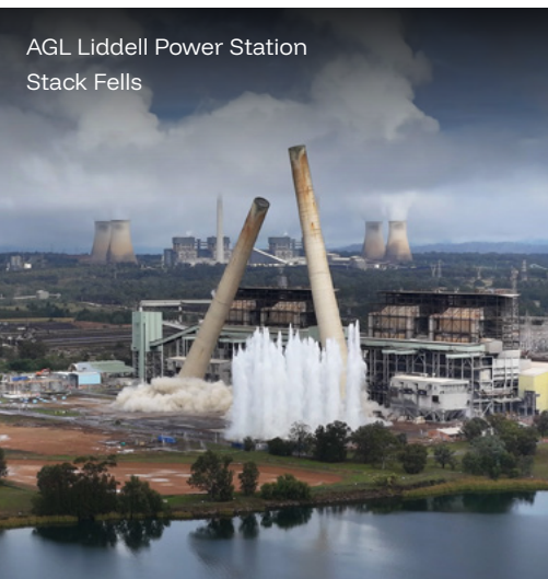
AGL Liddell Power Station Stack Falls