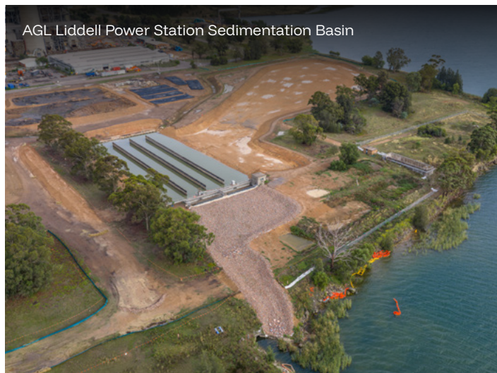
AGL Liddell Power Station Sedimentation Basin